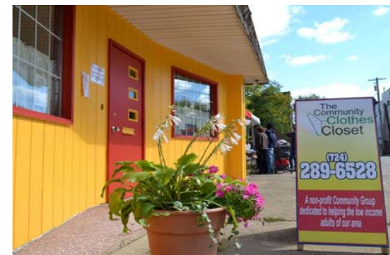
The Community Clothes Closet A Social Outreach Ministry of MSP

Your gift will help to build a future for our Catholic Faith in the Alle-Kiski Valley.