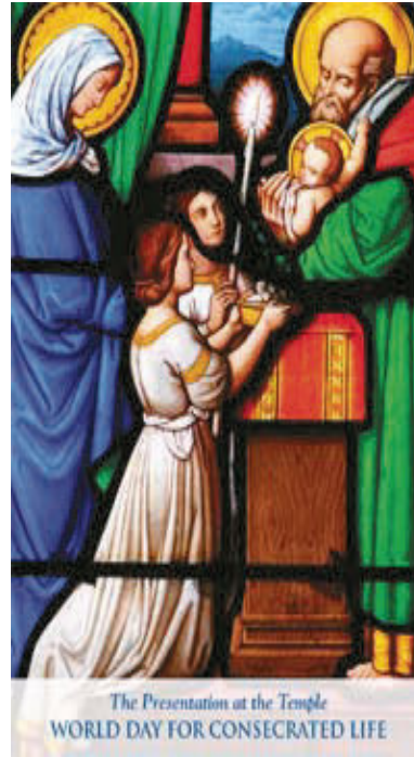
The Presentation at the Temple WORLD DAY FOR CONSECRATED LIFE

We rejoice with her parents and with all who celebrate her newborn life in the family of God.